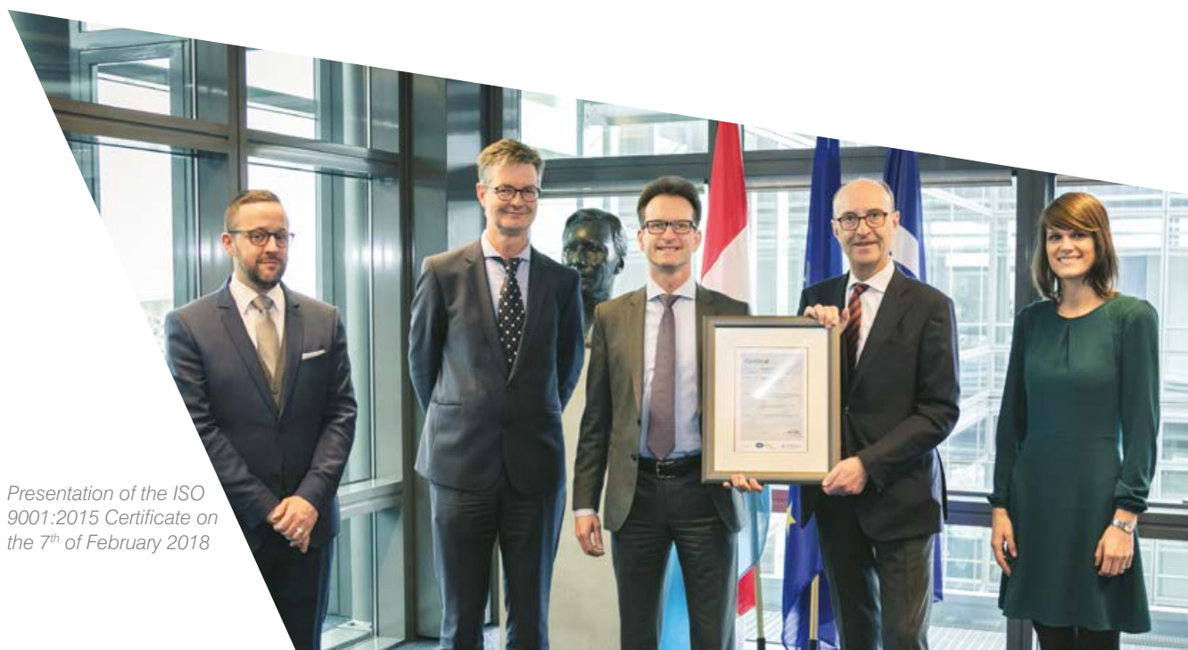
Presentation of the ISO 9001:2015 Certificate on the 7 th of February 2018

Our quest for constant improvement also incorporates our commitment to sustainable development. The Chamber of Commerce has also received the Socially Responsible Enterprise certification (the Entreprise Socialement Responsable, ESR, label) from the Luxembourg National Institute for Sustainable Development and Corporate Social Responsibility (INDR).