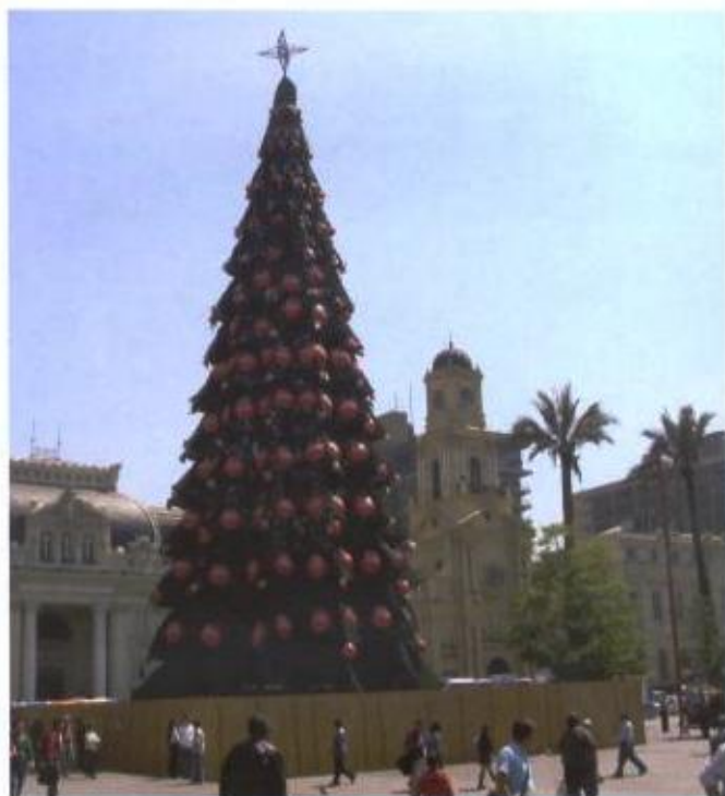
Christmas tree on Santiago de Chile's central square Finance and industry to Chile

The full range of Luxembourg's economy was presented to the Chilean business community during a State Visit held last November. Since the 1990s this South American country has been booming, making it a target for both financial and industrial firms.