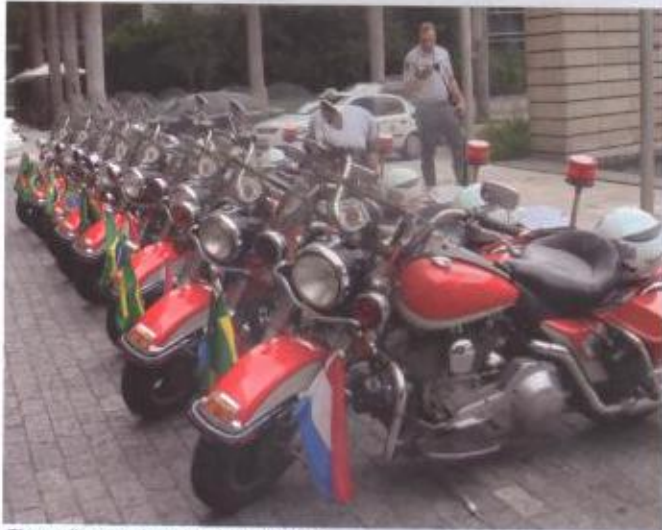
The police escort motorbikes for the State Visit to Sao Paulo

After Chile, the State Visit and trade delegation crossed the continent to take in the Brazilian commercial capital Sao Paulo. Such is the size of population and recent growth that Brazil is now ranked as the ninth largest economy in the world, making it a must-visit for the Grand Duchy's business community. The country is an important player in the steel industry as it is blessed with abundant natural resources, and has had a long relationship with Luxembourg in this sector.