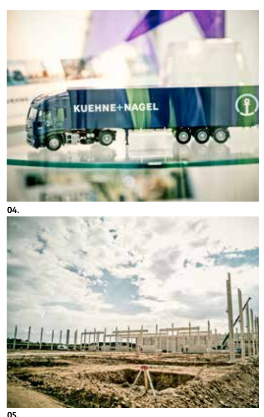
L'information continue Retrouvez toutes les visites d'entreprises sur www.cc.lu

03, 06. The logistics sector has excellent opportunities for successful students at all levels and Kuehne + Nagel as a global company offers significant possibilities both on a national and an international level. 05. The new facility in Contern will be a 46,000m<sup>2</sup> state-of-the-art warehouse, which is planned to go into operation by December this year.