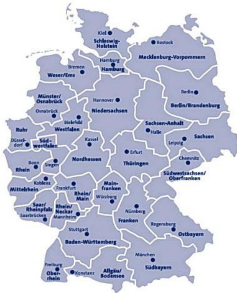
Chapters in Germany