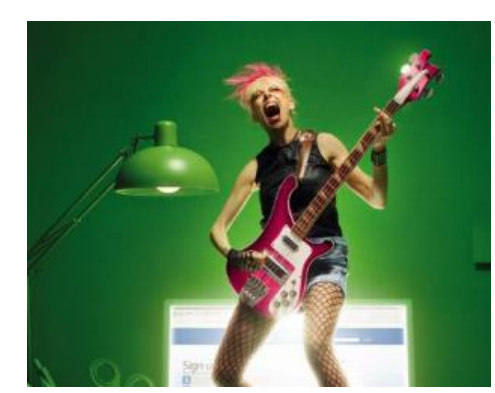
2015: Strong Passwords