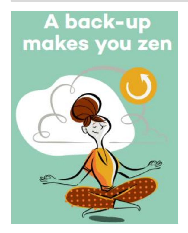
2018: Boost your digital heatlh