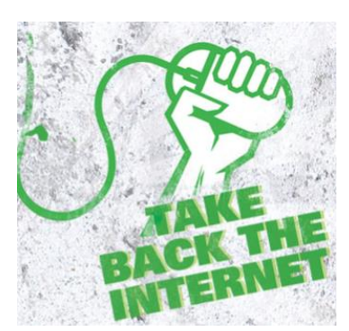
2016: Safe internet behaviour