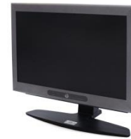
Comex® Screen Client