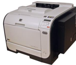
Comex® Colour Printer