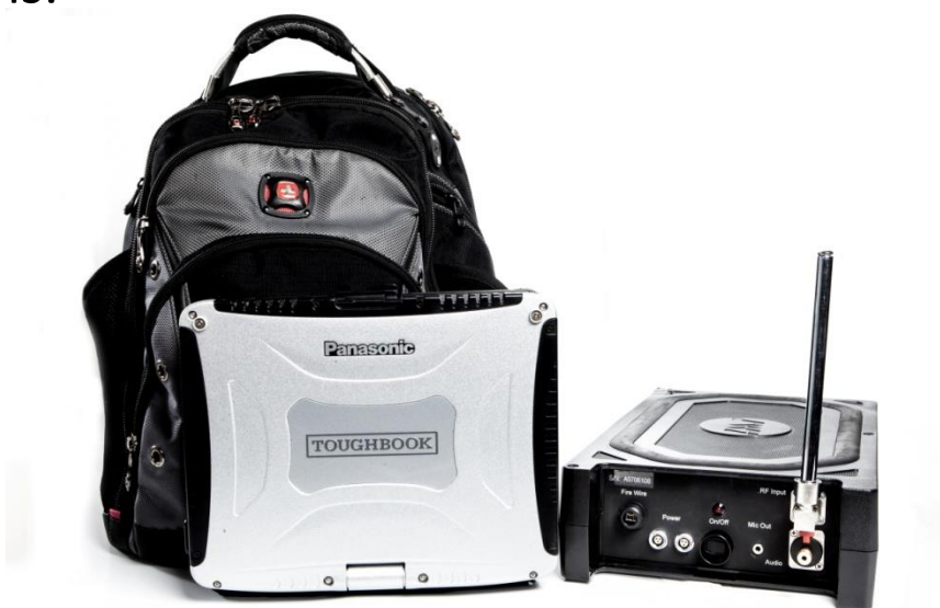
Raider II from SystemWare-Europé Ltd