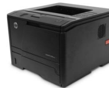
Comex® Laser Printer