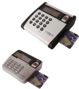
Comex BioSec Reader®