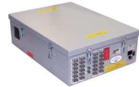
Comex® Secure Cabinet