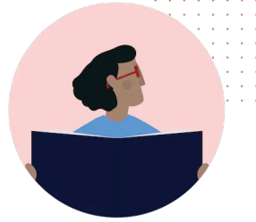
Learning and development