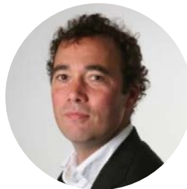
Will Lewis CEO Dow Jones