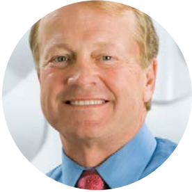
John Chambers Executive Chairman Cisco Systems