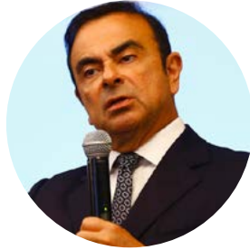
Carlos Ghosn CEO & Chairman Renault-Nissan