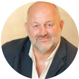
Werner Vogels CTO Amazon