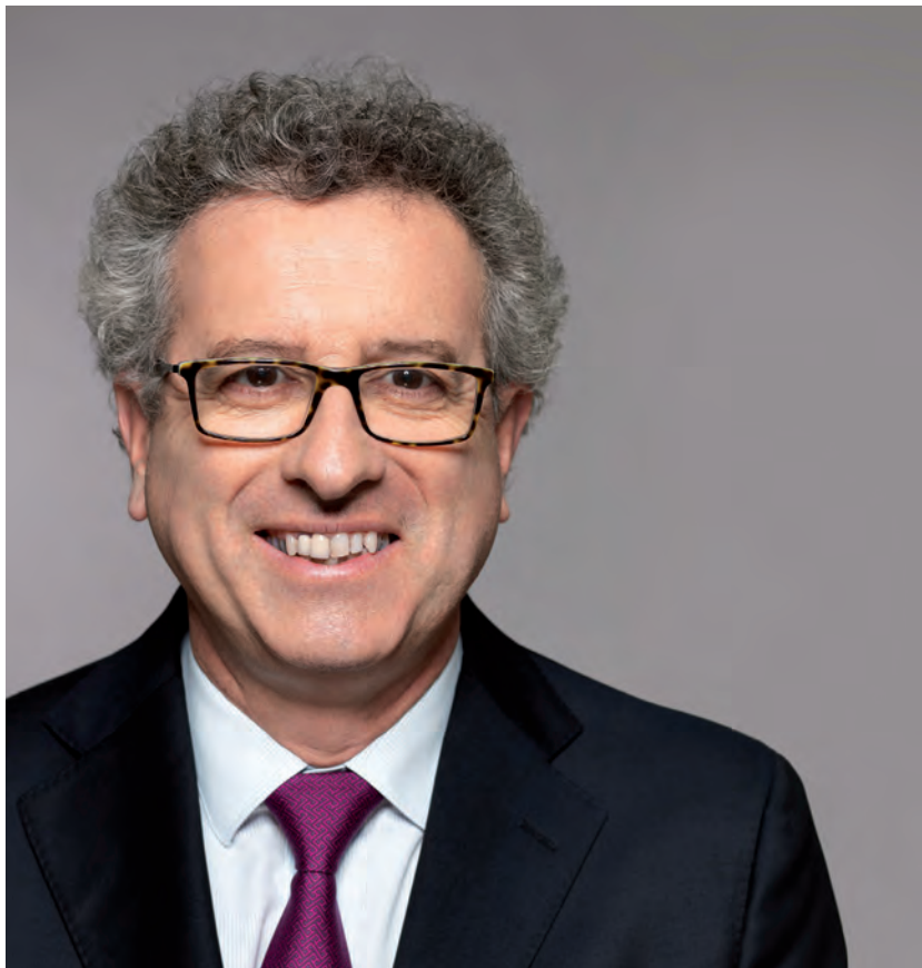
Pierre Gramegna Minister of Finance