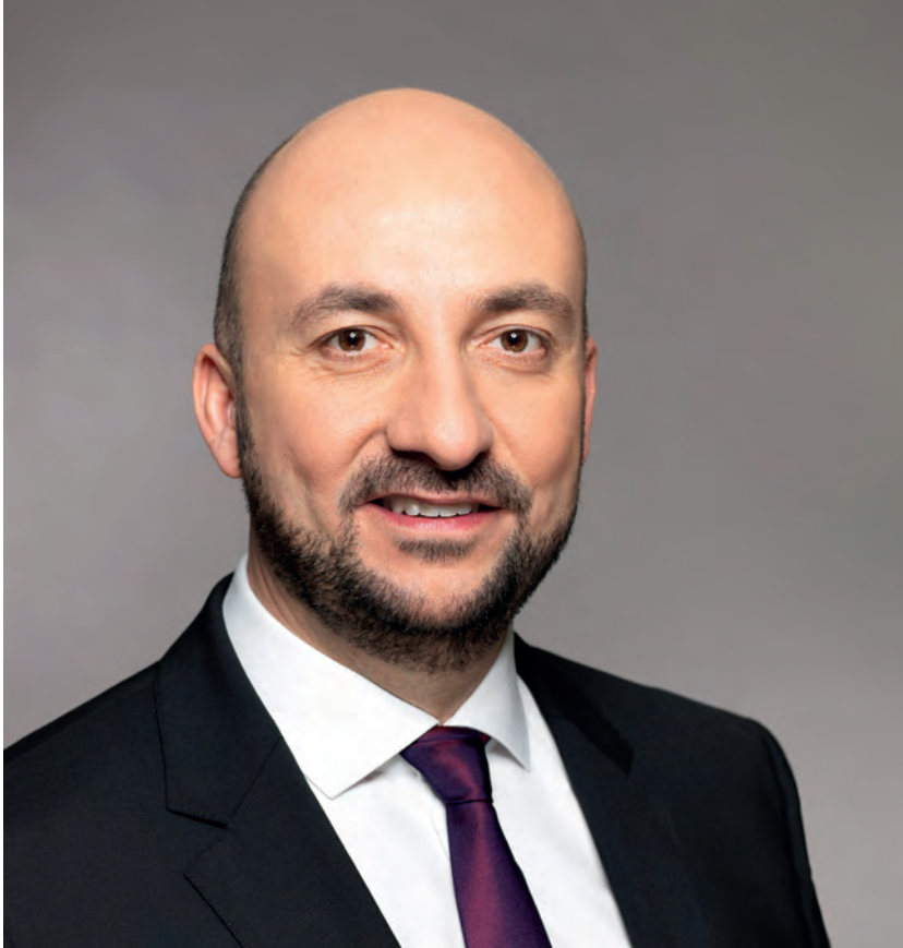
Étienne Schneider Deputy Prime Minister, Minister of the Economy