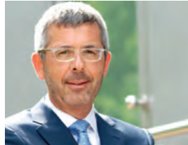
Serge de Cillia Chief Executive Officer

Financial Centre regulator (CSSF), the Luxembourg Central Bank (BCL), the Luxembourg employers' association UEL, Luxembourg social security institutions, various EU expert groups, the European Banking Federation, the European Covered Bond Council, the European Payments Council and XBRL Europe.