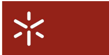
Universidade do Minho

| The main external partners are: Minho University and Portuguese FootWear Technological Center.