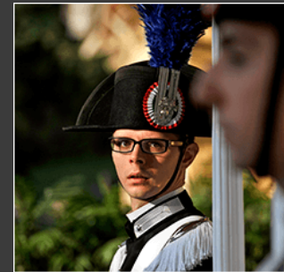
Hats & Caps