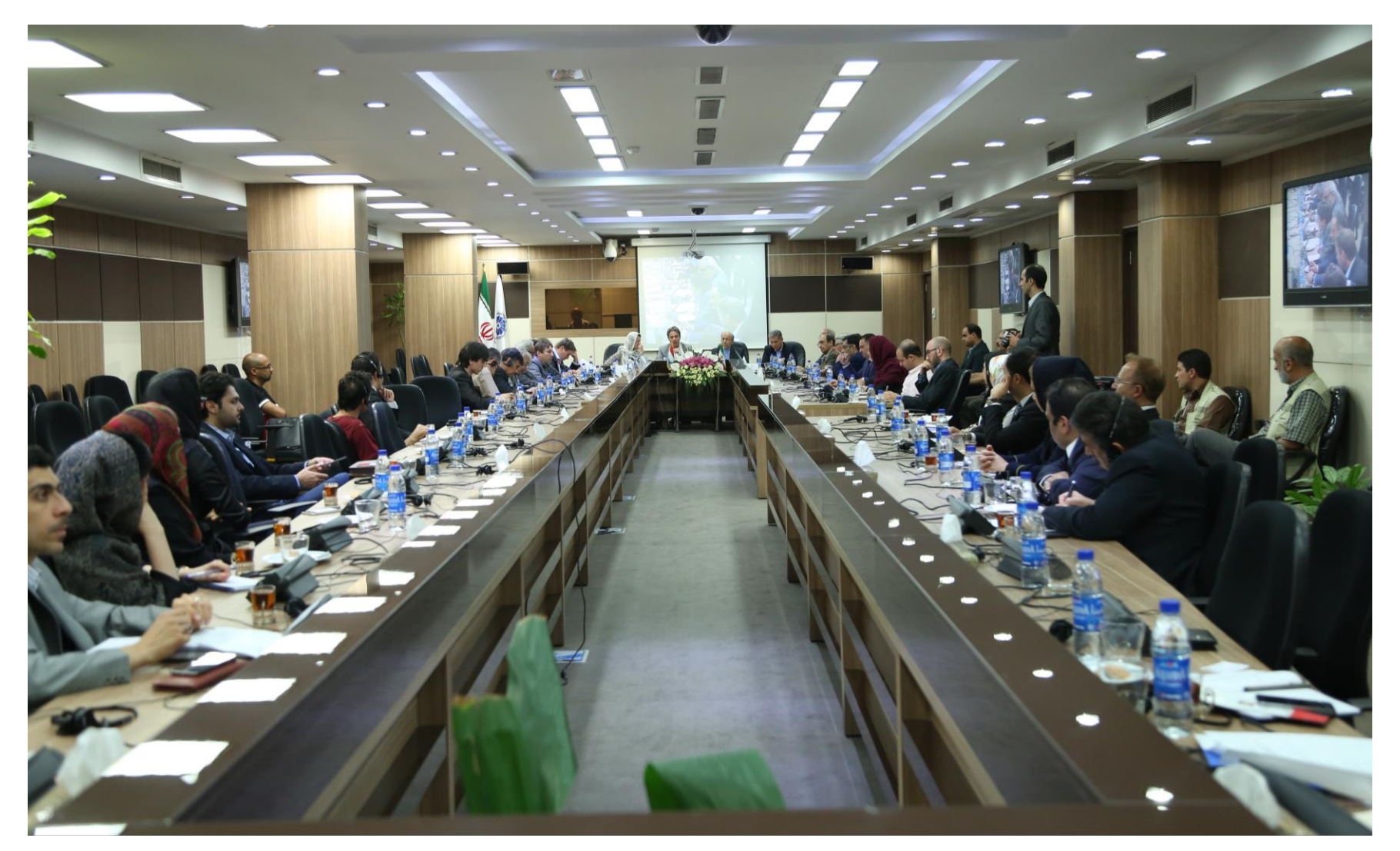
Meeting of the Luxembourgish delegation with Iranian Merchants – June 9 2015 – Tehran