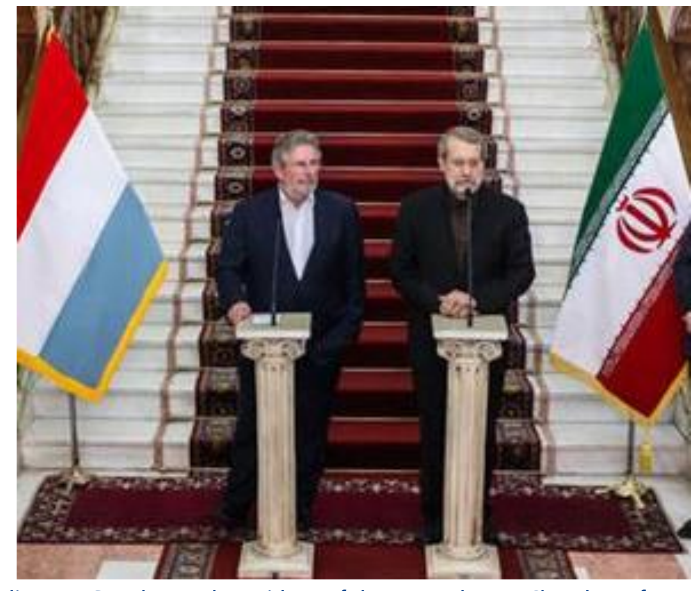
Iranian Parliament Speaker and President of the Luxembourg Chamber of Deputies speak in a joint press conference in Tehran on January 16, 2016 http://www.presstv.ir/Detail/2016/01/16/446032/Iran-Luxembourg-Larijani-Bartolomeo-JCPOA