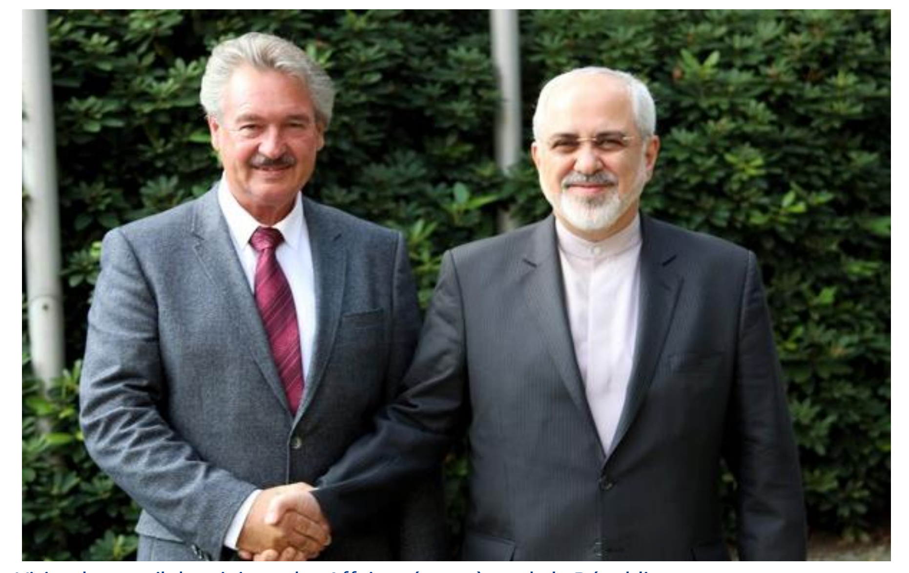
Visite de travail du ministre des Affaires étrangères de la République islamique d'Iran, Mohammad Javad Zarif, au Luxembourg