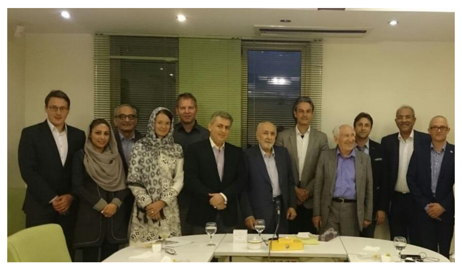
Luxembourgish delegation meets IRALUX Board – June 9 2015 – Tehran